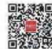
Sany subscription number QR code