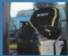
Multi-directional adjustable suspension seat, improve the operating comfort of the driver