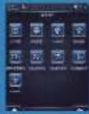
Integrated key panel, more convenient operation