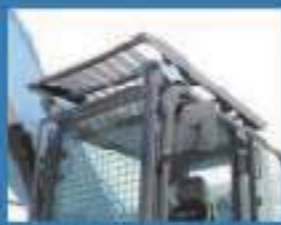
Large area skylight