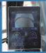
Brand new 10 hour color display