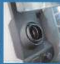
New layout of air outlet